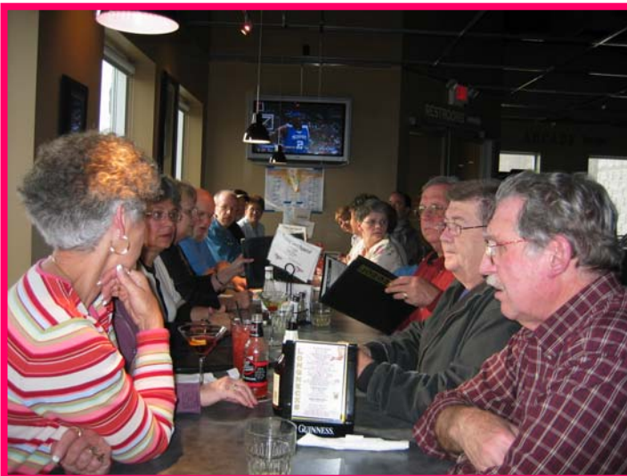
What a motley, but fun, crew!