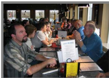
"Uh, hey guys, are we having fun yet?"