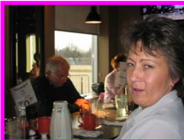
"Don't even think about touching my Martini, buddy!!"